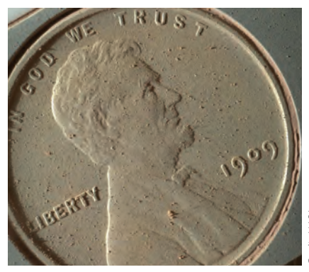
Imaging Martian dust.

They include the Mars Hand Lens Imager (MAHLI) that captures close-up color images of rocks and surface material at a resolution of up to 14.4 \mu m per pixel and the main "MastCam" used by the rover, which is actually two separate cameras allowing detailed near-field and far-field images to be captured.