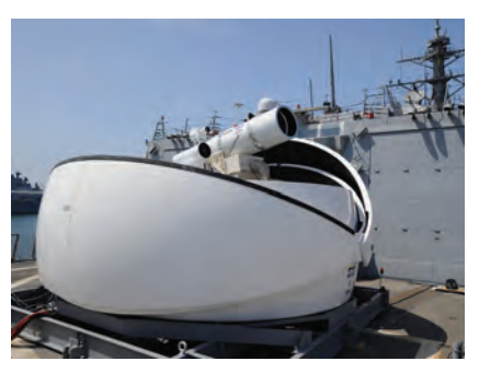
More bang, less bucks: the Laser Weapon System will be installed on USS Ponce.

Over the past several months, working under the ONR Quick Reaction Capability program, a team of Navy engineers and