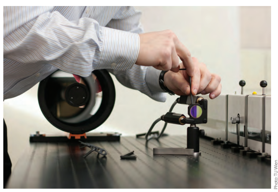
Photonics kit for stand-off spatially offset Raman spectroscopy (SORS) includes a nanosecond-pulse frequencydoubled Nd:YAG laser (right), and a 6-inch Schmidt-Cassegrain telecsope (left).

Scientists in Austria have found a way to extend a Raman spectroscopy technique so that it can detect signs of explosive materials inside opaque containers from a distance of more than 100 meters.