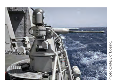
Fire power: Use of high-energy lasers on naval platforms has been one of the major R&D focuses of the military and industry partnerships working on directed energy system development.

The primary purpose of the MK38 MOD2 machine gun is defense against small boat swarms including Fast Attack Craft (FAC) and Fast Inshore Attack Craft (FIAC).